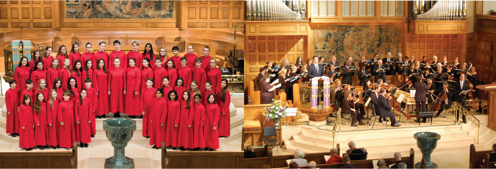
Left: The New York City Children’s Chorus ; Right: Saint Andrew Chorale & Orchestra

To close its 50th Season, the Saint Andrew Chorale will be joined by the Concert Choir and In Harmony ensembles of the New York City Children’s Chorus in performances of works by American composers. Featured are Randall Thompson’s a cappella masterpiece, The Peaceable Kingdom; Aaron Copland’s Old American Songs and “The Promise of Living” from The Tender Land; African-American spirituals and other choral works by Thompson and Howard Hanson. Admission is by ticket of $25 ($20 – students/62+; children 12 & under: free), available in advance at www.mapc.com/music/sams or at the door.