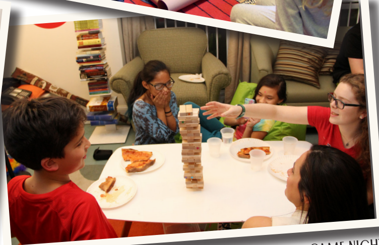
MIDDLE & HIGH SCHOOL PIZZA & GAME NIGHT