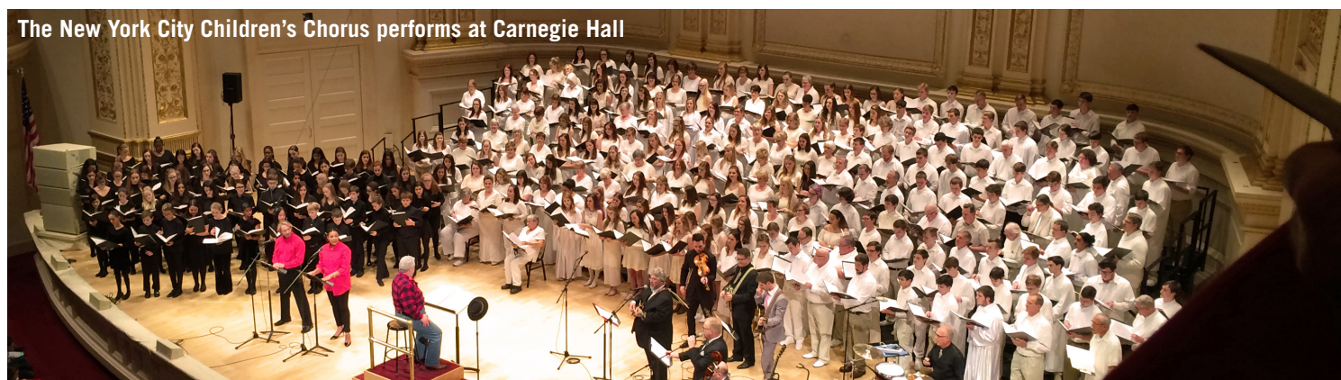
The New York City Children's Chorus performs at Carnegie Hall