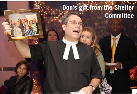
Don's gift from the Shelter Committee