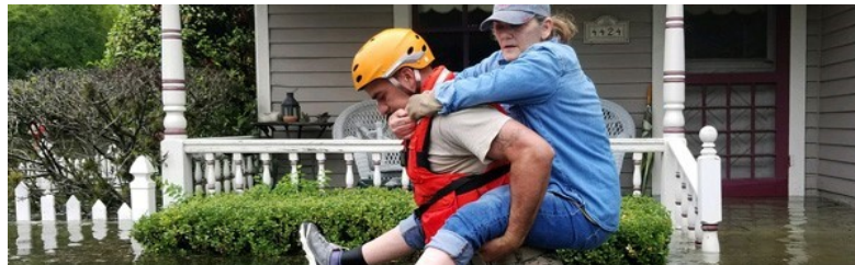
A Texas National Guardsman carries a resident from her flooded home following Hurricane Harvey in Houston.

It is expected that 450,000 people will seek help from the Federal Emergency Management Agency after Hurricane Harvey. Hurricane Irma is believed to have caused more than $50 billion in damage. The entire island of Puerto Rico is without power after Hurricane Maria. Islands in the Caribbean Sea are devastated. Please pray for those affected.