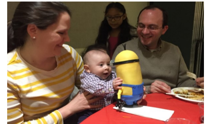
Families enjoying Church Family Night.