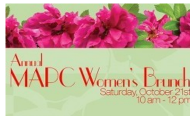
Annual Women's Brunch