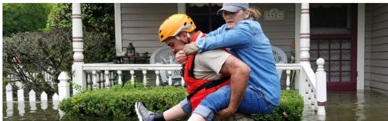
A Texas National Guardsman carries a resident from her flooded home following Hurricane Harvey in Houston

The destruction from recent hurricanes has been widely published and work has begun to help people recover. Residents of Texas, Florida, Louisiana, Puerto Rico, Barbuda, the Virgin Islands, Cuba, and elsewhere will be impacted for years to come. Many are still trying to meet immediate and basic human needs. Fires in the Western United States have destroyed homes and displaced many. Natural disasters continue to affect people throughout our world—including famine in South Sudan. Please pray for those affected.